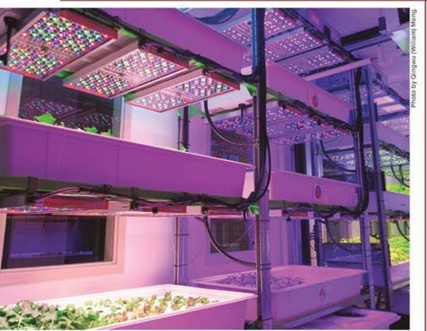
Figure 1. The Controlled-Environment Lighting Laboratory (CELL) at Michigan State University. The growth room consists of hydroponic growing racks with customizable light-emitting diodes (LEDs).

Red-leaf lettuce Rouxai was selected for this study because of its commercial relevance and sensitivity to the light spectrum. Lettuce seeds were sown in 200-cell rockwool sheets and germinated at ambient CO2, a temperature of 74F (23C) and under 180 µmol·m<sup>-2</sup>·s<sup>-1</sup> of warm-white light provided by light-emitting